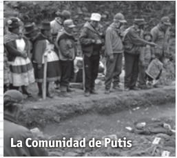
La Comunidad de Putis